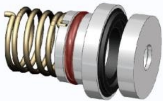
AS-AP09 stationary seals to suit Ag ,ZG ,AR and Zr series pumps. Have size 16/24/25/35mm.